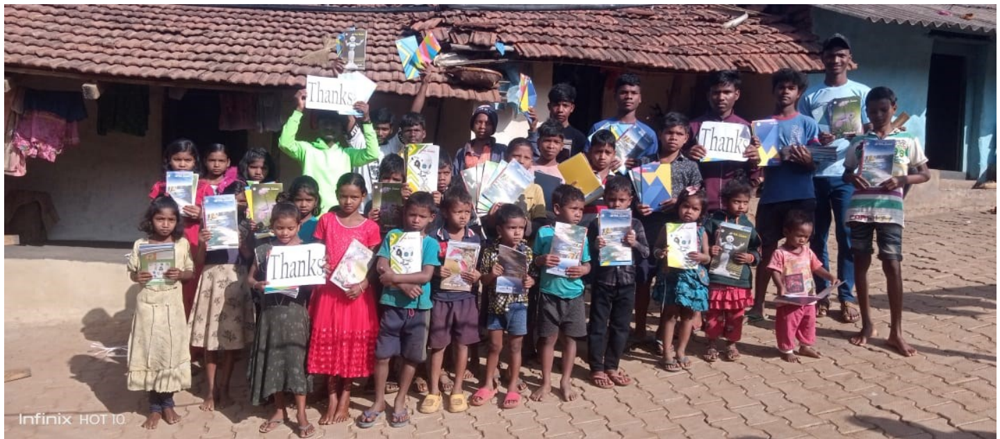
Above: A children's Bible class